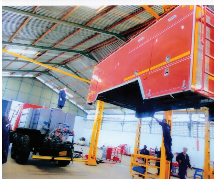
Engineers and Technicians fitting fire fighting body on chassis