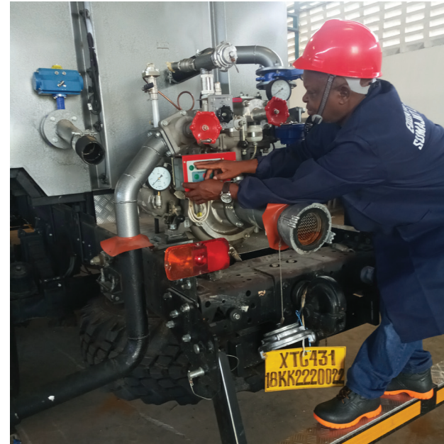
Engineer Inspecting the new pump after fitting