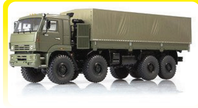
Troop Carrier 8x8