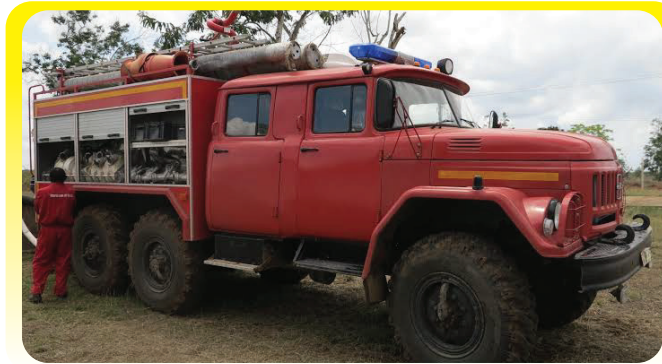
Fire fighting model ZIL 6x6 water Carring capacity 3000 liters, 250 litres of foam and throating distance 70 metres