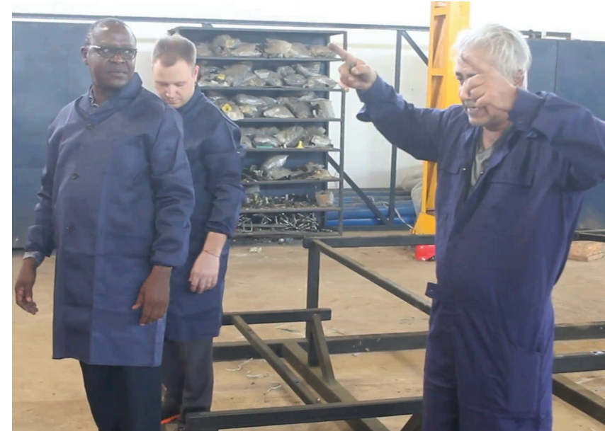
Engineers Team discussing before assembling