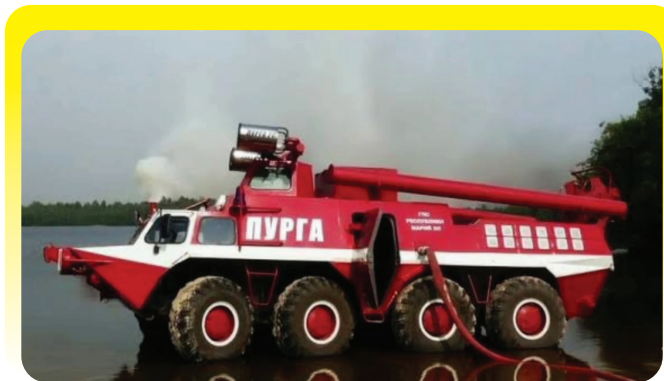
Fire fighting Amphibian rescue Vehicle