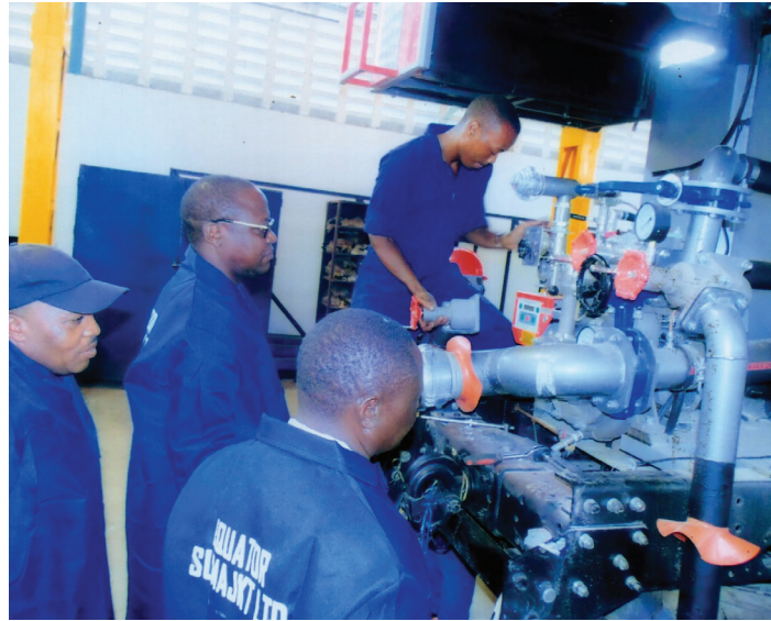
Engineers and Technicians fitting fire fighting pump