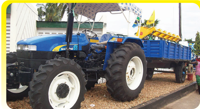
Tractor & Trailer