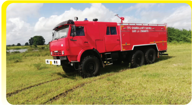
Fire fighting model KAMAZ 6x6 water Carring capacity 6000 liters, 300 liters of foam and throating distance 100 metres