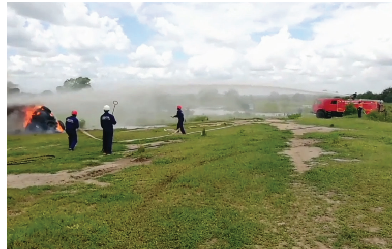
Fire Fighting Throating Water