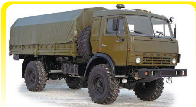
Troop Carrier 4x4