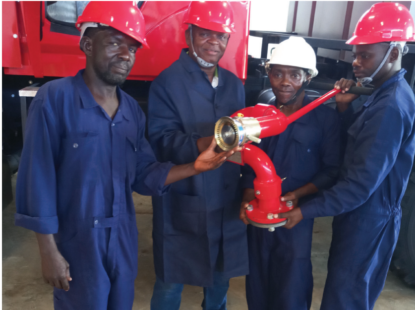
Engineers and Technicians with roof monitor

The production of fire fighting trucks was started using rolling chassis of KAMAZ 6×6 with water carrying capacity of 6000 litres and 300litres of foam. The factory can use any chassis from any country's reliable manufacturer.